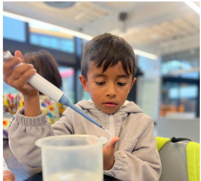
Science Leader working with a pipet to analyze plankton DNA.

It has been a busy start of the year in our programming. Our Ocean Leaders toured the labs at Scripps Institution of Oceanography and learned about graduate students' research projects. We continue our after-school enrichment programs at the living Lab with students conducting experiments onsite and using DNA electrophoresis machines to investigate plankton DNA.