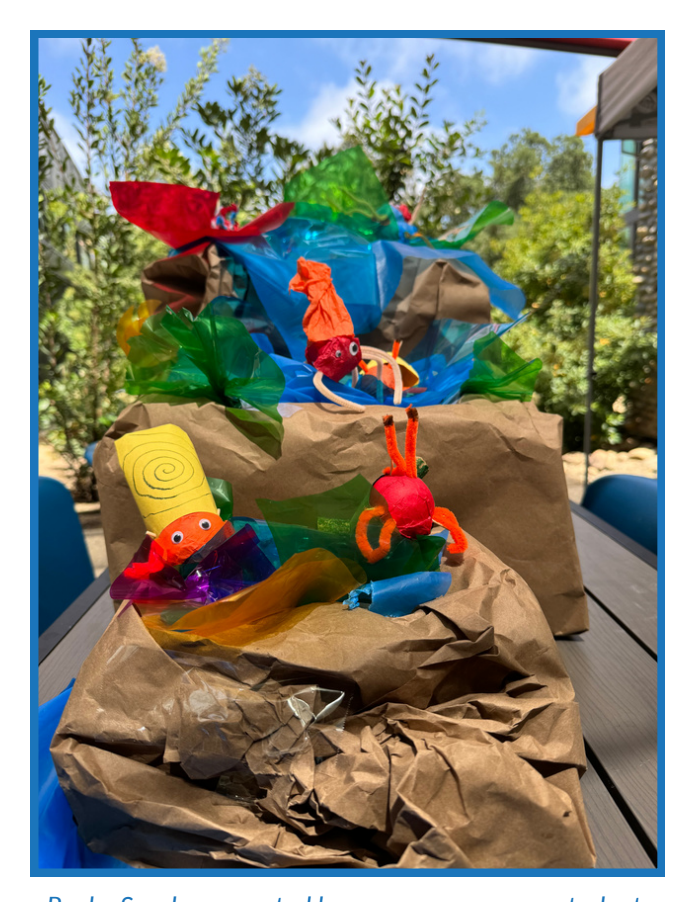
Rocky Seashore created by our summer camp students