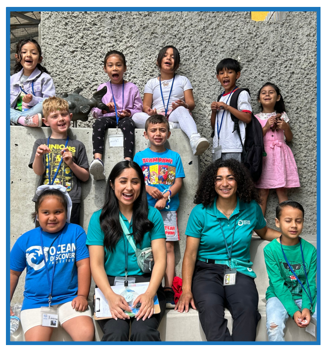
Summer Camp students ready to start the week