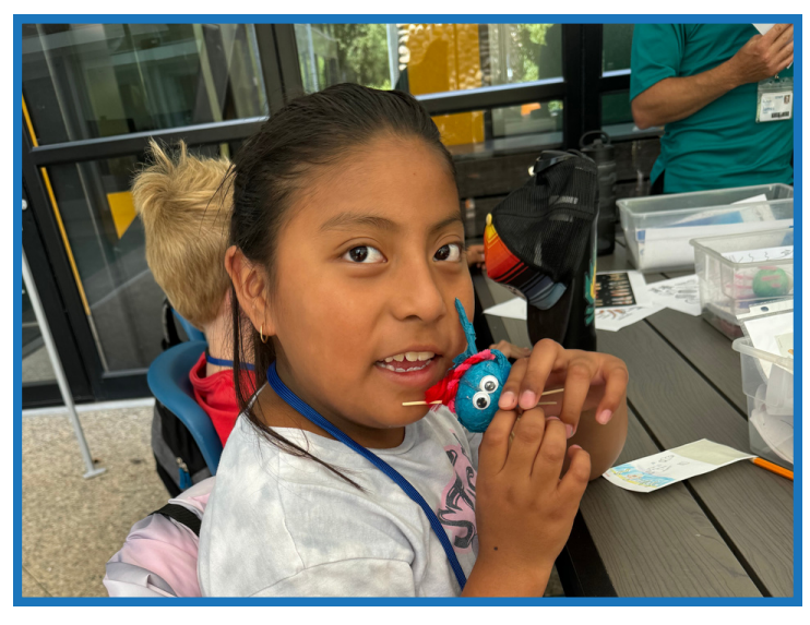
Students create their own invertebrates

We are passionate about sparking a lifelong interest in nature and science, and we are overwhelmed with the enthusiasm and discoveries that this summer has brought our students.