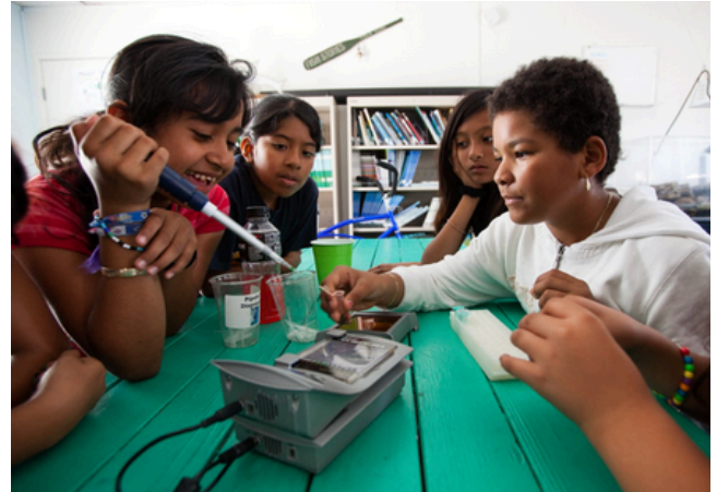
Join us in support of the next generation of Science Leaders

On May 18th, we are hosting our 2nd annual SPLASH! fundraiser supporting tuition-free science for students in City Heights. The event is a move from our traditional black-tie fundraisers of the past to innovate to a more equitable philanthropic fundraising model. We lowered event costs and decreased the price of admission, all to ensure that more of each contribution will go directly to programs and that our entire community of support – from families to donors to partners – can attend.