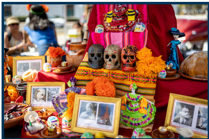
Honoring loved ones through the vibrant traditions of Día de Muertos, a celebration of life and memory

Events like this beautifully highlight the richness of life in City Heights, the power of cultural traditions, and the beauty of diversity. We're already looking forward to next year's celebration!