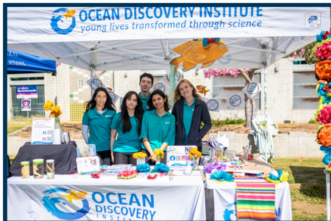
This marks our fifth year of participation