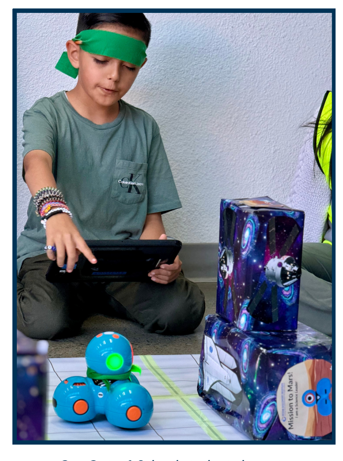
Our Out-of-School students learn to program their robots by using iPads!

By the end of the program, our young explorers will have not only developed a deeper understanding of STEM (Science, Technology, Engineering, and Mathematics) but also gained essential skills such as teamwork, problemsolving, and perseverance. We are excited to see the incredible discoveries they will make and the boundless enthusiasm they will bring to this extraordinary adventure.