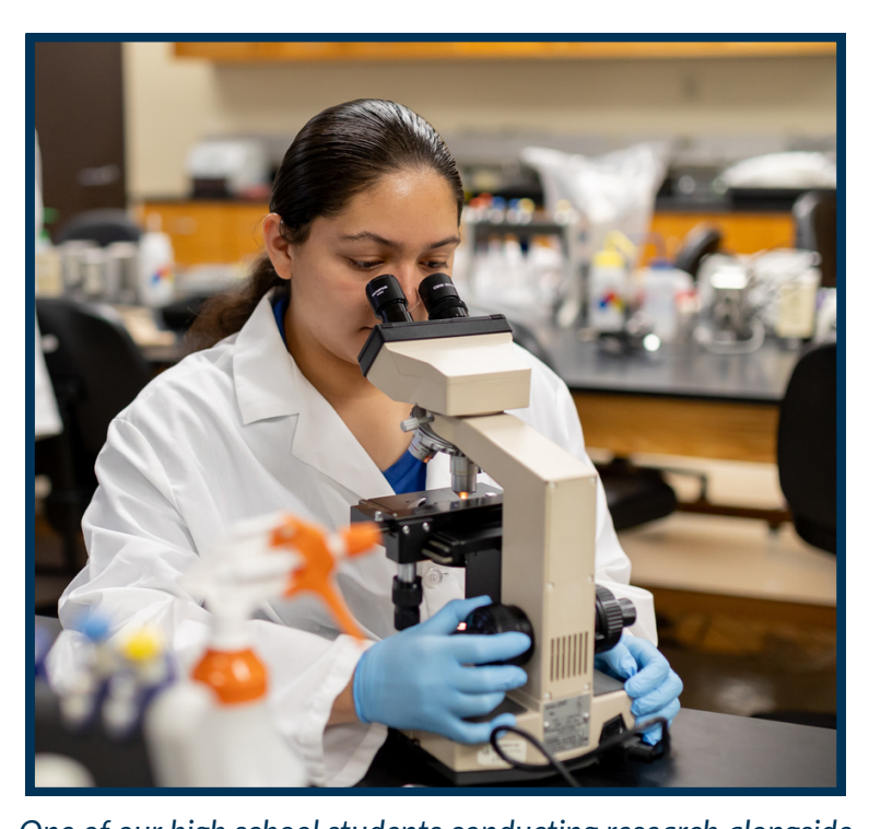
One of our high school students conducting research alongside partners and professors at the University of San Diego.

We are absolutely thrilled to announce that, thanks to your incredible generosity, we not only met but greatly exceeded our San Diego Gives campaign goal! We raised over $10,000 to ensure Ocean Leaders have what they need to become the science leaders we need.