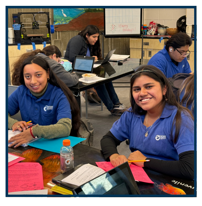
Upperclassmen are prepared to mentor our younger students for the upcoming school year.

Each mentor-mentee pair will have the opportunity to participate in a variety of activities designed to build trust, foster collaboration, and enhance personal growth. These activities will include team-building exercises and academic workshops. We believe that this mentorship model will not only help our younger students navigate the challenges of high school but also empower our older students to develop crucial leadership skills that will serve them well in college and beyond.