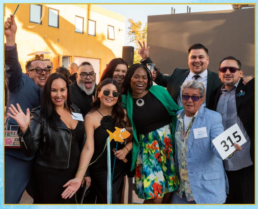
More details and a formal e-invitation to follow.

This cocktail-style event will include drinks and appetizers from our local Mexican Eatery, opportunities to mingle with other Ocean Discovery supporters, alumni, and volunteers, and, of course, chances to hear directly from our students about their experiences!